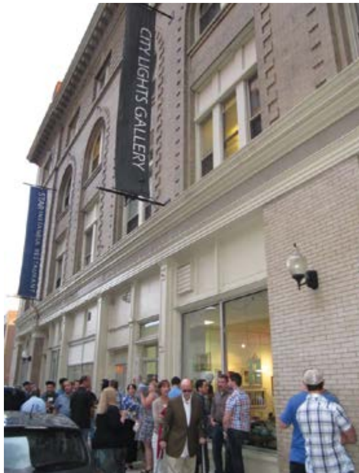
City Lights opening night

City Lights Outreach provides opportunities for artistic expression and self-discovery for Bridgeport youth and adults. Among our community partners are ALPHA Community Services and Bridgeport Mental Health and several Bridgeport schools. Art integration programs connect art to science to foster good stewardship and an enthusiasm to learn and apply knowledge. These programs also offer work opportunities for local artists. For more info about outreach programs in the schools and community, visit www.citylightsgallery.org