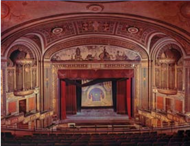
Palace Theater, Bridgeport