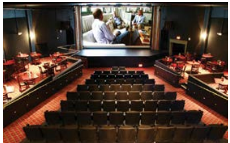
Interior of Bijou Theatre