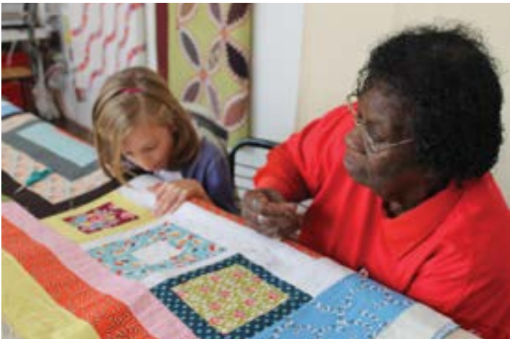
Denyse Schmidt Quilts Annual Sample Sale, Studio 401 (#1)

Sample quilts for discerning collectors; fabric, patterns, books, stationery, and other supplies for sewists, makers, crafters, and quilters! Prices range from $10 to $5,000. Serious buyers should