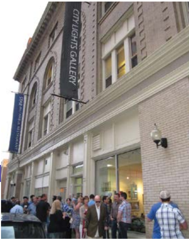
City Lights opening night

the Fantastic Four, anglicized their names: writer/editor Stan Lee was Stanley Lieber and artist/storyteller Jack Kirby was Ya'akov Kurtzberg.