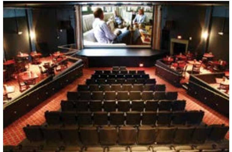
Interior of Bijou Theatre