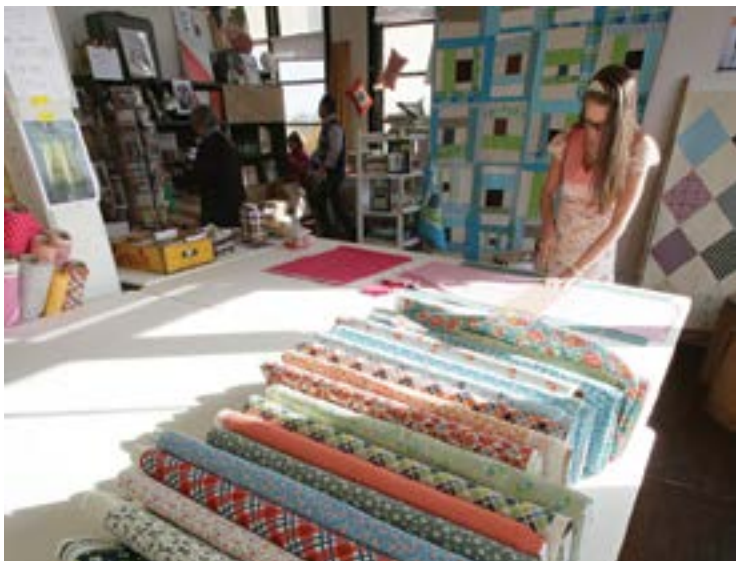
Denyse Schmidt Quilts Annual Sample Sale, Studio 401 Photograph: Kvon (#1)

There will be food trucks from the Snappy Dawgs (Bridgeport) and Four Flours Bakery (New Haven) in the east parking lot to serve our patrons from 10 am to 5 pm each day. Music and participatory performances will offer fun for the whole family! Ample onsite free parking and handicapped access.