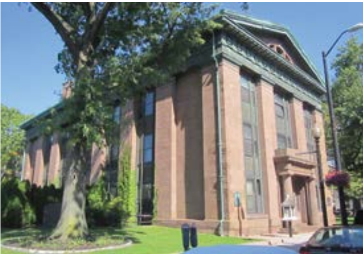
Historic McLevy Hall, UArts, downtown Bridgeport